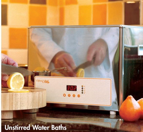
Unstirred Water Baths