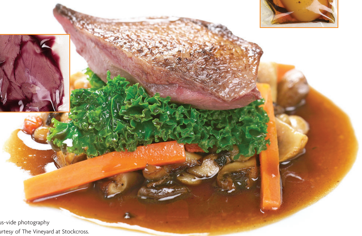
Sous-vide photography courtesy of The Vineyard at Stockcross.