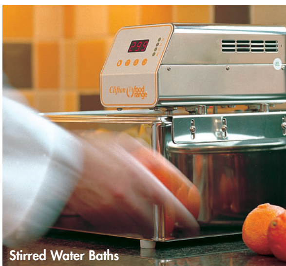
Stirred Water Baths

The Clifton Food Range has been developed and manufactured by Nickel-Electro. A family firm based in the South West of England, Nickel-Electro is a brand leader in temperature control laboratory and science equipment.